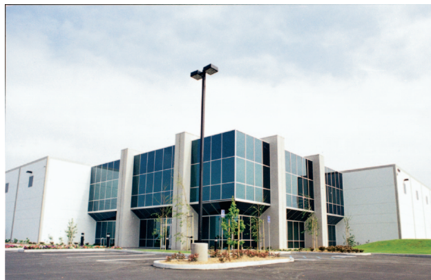
Vortech occupies a 60,000 square foot facility that houses administration, engineering, manufacturing, testing, quality control, sales and marketing.

Vortech Engineering, LLC, is an advanced technology and manufacturing company serving customers worldwide with centrifugal/industrial drying, aeration, de-watering and blow-off systems, supercharging systems and components. The corporation, which is headquartered in Channel Islands, California, employs 70 people and has four major business units: Engineered Material Services, Automotive, Marine and Vortron Industrial.